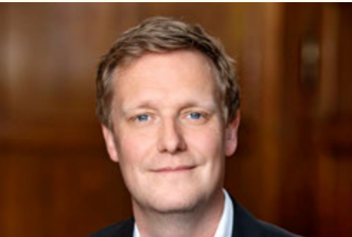
Jens-Kristian Lütken Mayor of Employment and Integration